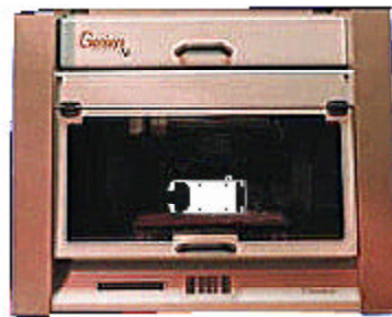
Rapid Prototype Sample Part